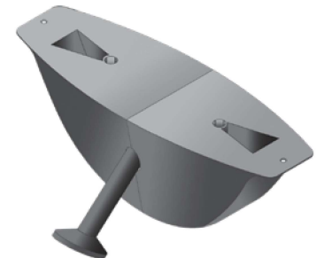
P76D Disposable Utility Anchor Setting Plugs 0.671

The Disposable Setting Plug is manufactured to offer the precastor an inexpensive alternate to urethane setting plugs. This 2 piece high density polyethylene plastic setting plug is used with the 0.671 Dayton Superior Utility Anchors. The two piece design snaps tightly together around the legs of the anchor eliminating concrete entering the void. The setting plug is installed to the formwork using nail holes on each end of the plug.