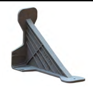
T70 EZ Nail Form Bracket