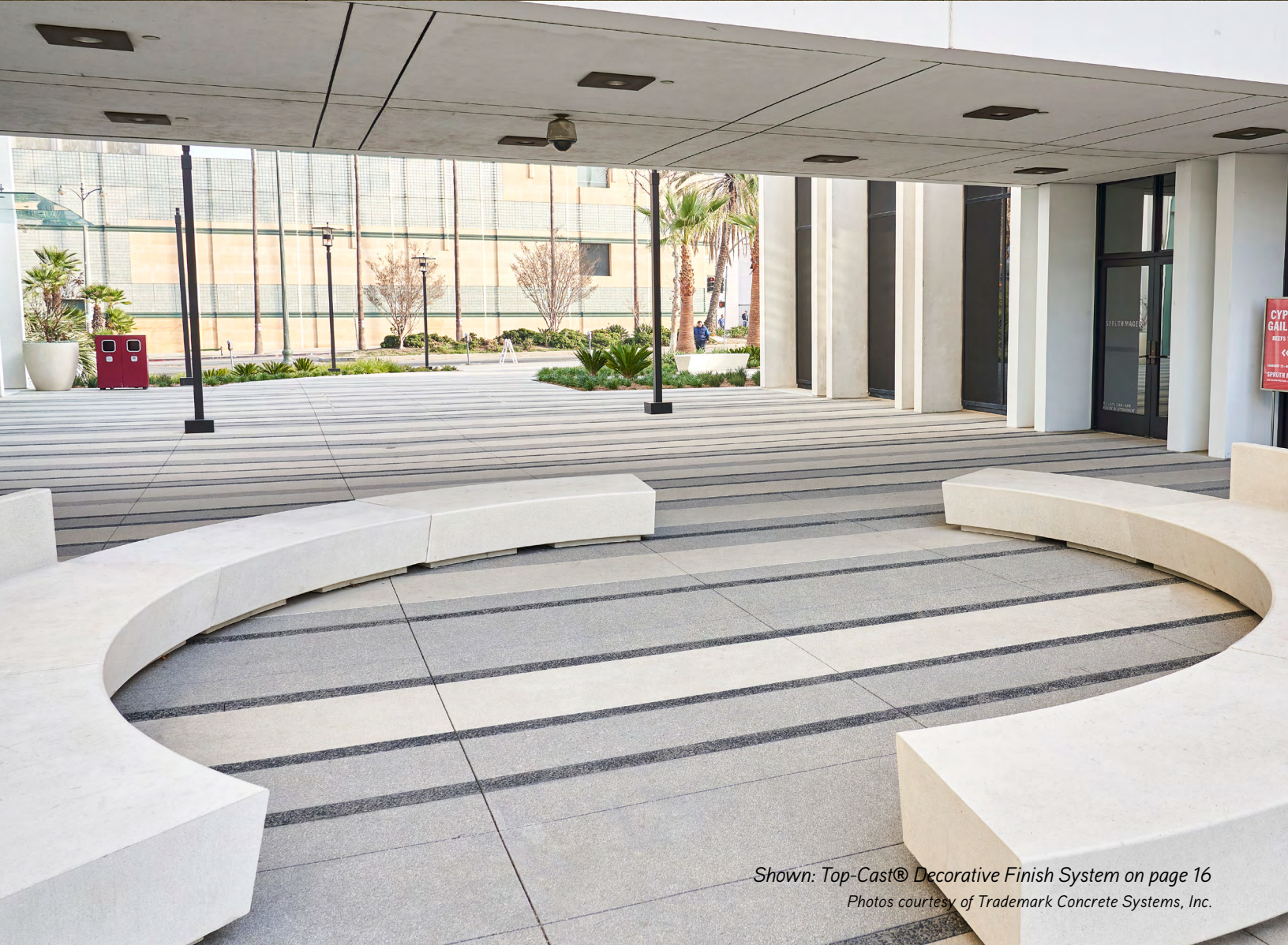
Shown: Top-Cast® Decorative Finish System on page 16