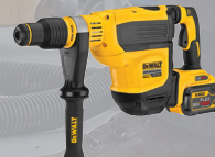
DCH614 60V MAX* Brushless 1-3/4" SDS MAX Combination Rotary Hammer

*With respect to 60V MAX*, Maximum initial battery voltage (measured without a workload) is 60 volts. Nominal voltage is 54.