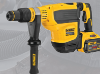
DCH614 60V MAX* Brushless 1-3/4" SDS MAX Combination Rotary Hammer

*With respect to 60V MAX*, Maximum initial battery voltage (measured without a workload) is 60 volts. Nominal voltage is 54.