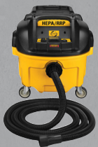
DWV010 8 Gallon HEPA/RRP Dust Extractor