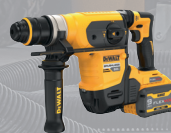
DCH416 60V MAX* Brushless 1-1/4" SDS PLUS Rotary Hammer