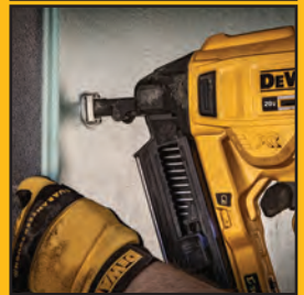
INSULATION & SURFACE PREP