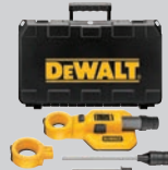
DWH050K LARGE HAMMER DUST EXTRACTION - HOLE CLEANING