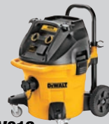
DWV012 10-GALLON HEPA/RRP WET/DRY DUST EXTRACTOR

*For 20V MAX* Maximum initial battery voltage (measured without a workload) is 20 volts. Nominal voltage is 18.