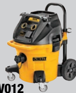
DWV012 10-GALLON HEPA/RRP WET/DRY DUST EXTRACTOR

*For 20V MAX* Maximum initial battery voltage (measured without a workload) is 20 volts. Nominal voltage is 18.