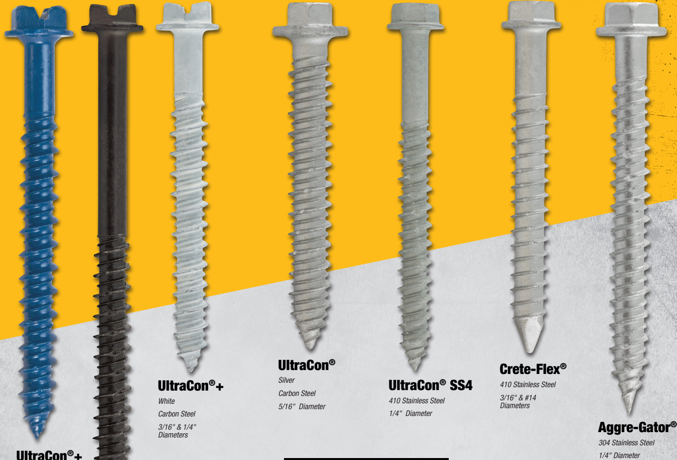
UltraCon®+ Blue Carbon Steel 3/16" & 1/4" Diameters