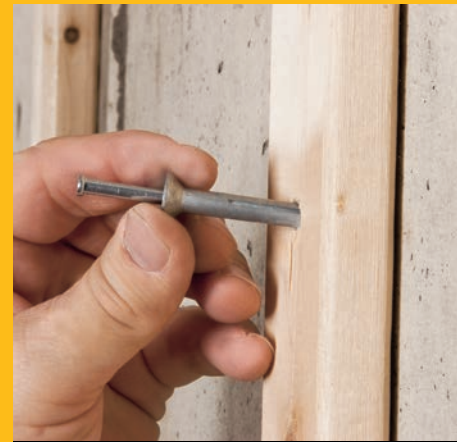
> Furring strips