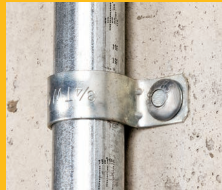
> Light duty electrical