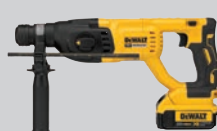
DCH133M2 20V MAX* XR® 1" D-HANDLE SDS+ ROTARY HAMMER