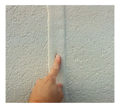
EIFS joint restored using DOWSIL™ 123 Silicone Seal