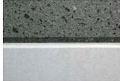
TERRANEO® & LIMESTONE

ON LARGER WALL SURFACES, EPS SHAPES AND AESTHETIC REVEALS ARE COMMONLY USED TO YIELD A REALISTIC LIMESTONE EFFECT.