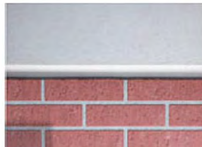
TERRANEO & CUSTOM BRICK™

LIMESTONE IS THE PERFECT FINISH ON WHICH TO APPLY DRYVIT TUSCAN GLAZE – RESULTING IN AN OLD WORLD PLASTER APPEARANCE.