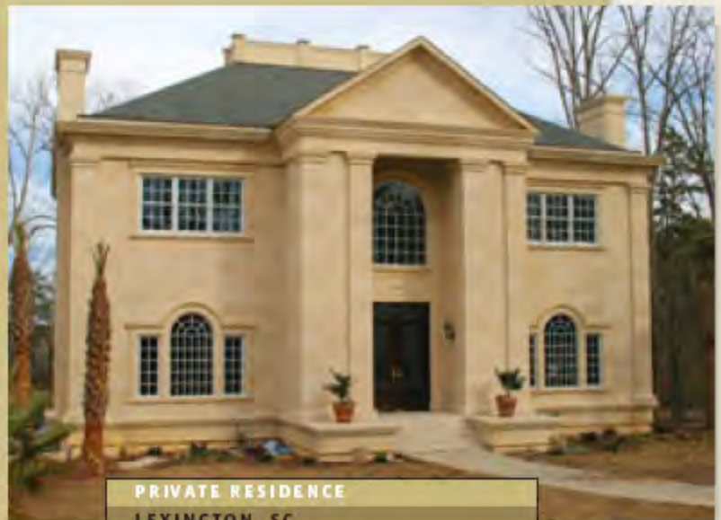
PRIVATE RESIDENCE LEXINGTON, SC

"I wanted something really special for my house, and I was so pleased with the results I got with the Dryvit Limestone product. People stop all the time to ask me questions about it, and they can't believe it's not limestone block on my house."