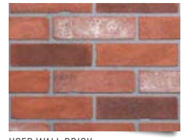
USED WALL BRICK