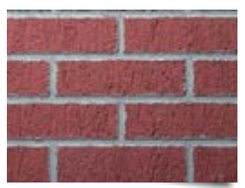
NY WALL BRICK 3/8"