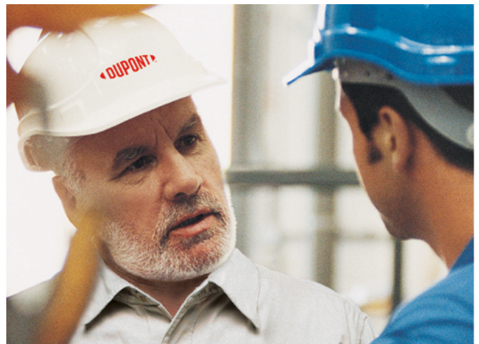
A Specialist is available to assist you throughout your DuPont™ Tyvek® installation.

The DuPont Building Knowledge Center is where DuPont building scientists and construction professionals can evaluate solutions and collaborate on new ideas that will assist you in building structures that are more energy efficient and durable. The DuPont™ Building Knowledge Center is a part of a long history at DuPont of scientific discovery and application knowledge that has changed the way people live, work