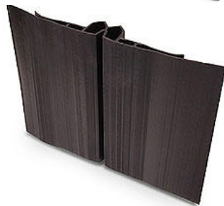
BG-0200 shown in positive side wall orientation.