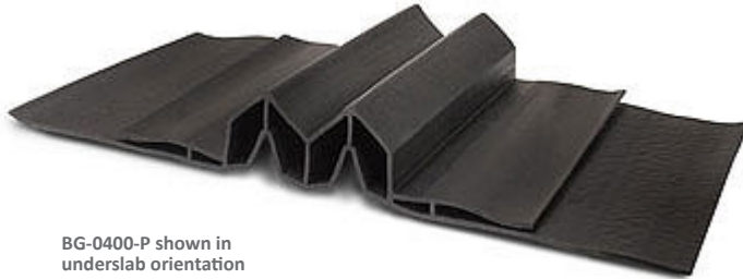
BG-0400-P shown in underslab orientation

For positive-side below-grade wall, blind-side formed foundation walls, and under slabs