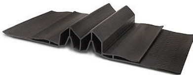
BG-0400 shown in underslab orientation