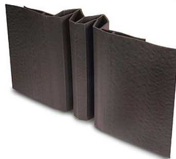
BG-0400 shown in positive side wall orientation.