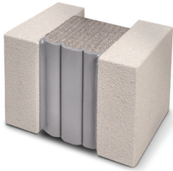
DSM-DS SYSTEM sample shown here is displayed in substrate mock-up

Dual-sided silicone bellows seals from both sides of joint