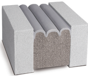
DSM System sample shown here is displayed in substrate mock-up

Watertight Joint System for Decks, Walkways, Ramps, Roadways and Below-Grade Applications