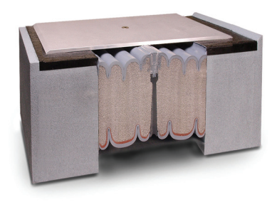
SJS-FR sample shown here is displayed in substrate mock-up

US Patents: 10,787,805 10,787,806 9,689,157 9,689,158 8,813,450 C1 8,813,449 C1 8,341,908