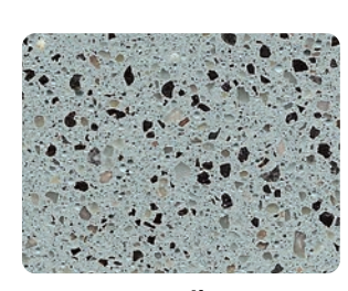
Nautilus 407ANT 50