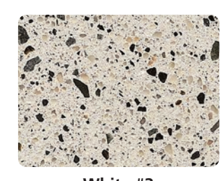
White #3 407W3 50