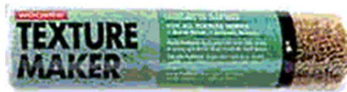
Example: Wooster 9" Texture Maker or similar Paint Roller

NOTE: Elevate's XR Bonding Adhesive requires the use of a solvent resistant paint roller. Application can be maximized through the use of a roller designed for medium to semi-rough textured surfaces.