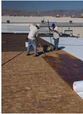
Unroll Method using UltraPly XR Bonding Adhesive

! NOTE: XR Bonding Adhesive is aggressive, and standard paint type rollers may not work for any extended period of time.