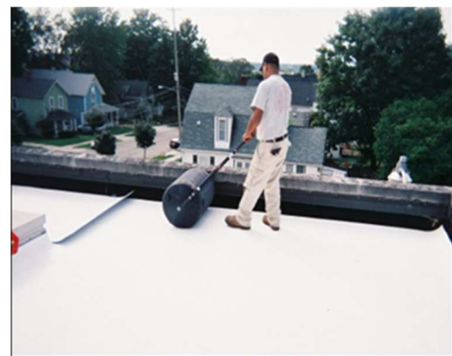
Apply pressure to the top surface of the membrane to ensure contact with a roller (not to exceed 150 lb/68 kg)