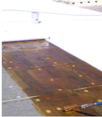
Roller application of XR Bonding Adhesive