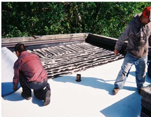
Roll UltraPly TPO XR into XR Stick or ISO Spray R Adhesive