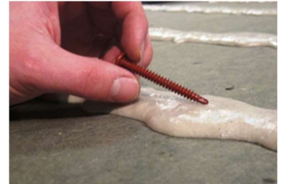
STEP 3: Tack-free stage – ready for application of UltraPly TPO XR Membrane (after 5 -7 minutes)