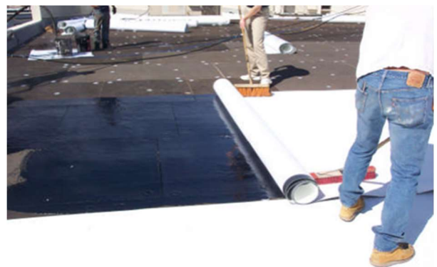
Brooming in the Membrane