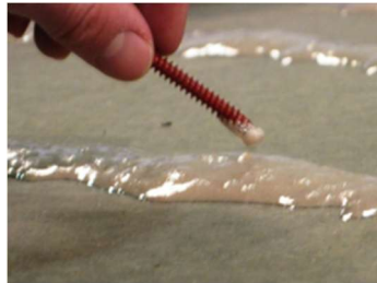
STEP 2: Allow ISO Spray R Adhesive / XR Stick Adhesive to rise (1 to 3 minutes)