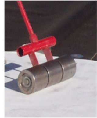
Weighted compression rolling of XR Membrane