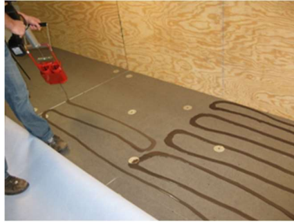
Bead application of XR Stick in cartridge on mechanically attached Polyisocyanurate insulation board @ 6" o.c.