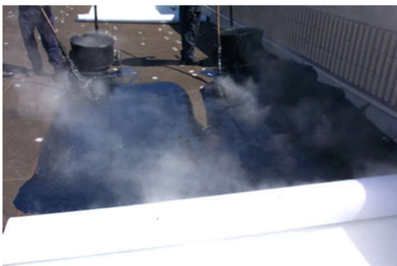
Unroll Method using Hot Asphalt