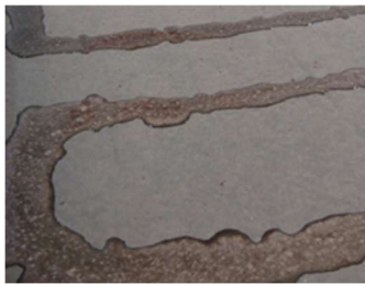
STEP 1: Freshly applied ISO Spray R Adhesive / XR Stick - cream stage

When applying ISO Spray R Adhesive or XR Stick, the TPO XR membrane must be placed into the adhesive while it is still wet and tacky (before it reaches tack free state). The membrane may be placed into adhesive shortly after it has reached its maximum rise, typically after 2-3 minutes.