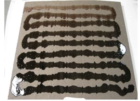
Freshly applied beads of XR Stick on mechanically attached Polyisocyanurate insulation board @ 4" o.c.