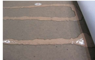
Close up of 12" Bead Spacing