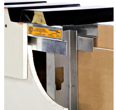
Fire Trak 1 Hr. Shadowline Standard Wall - 1" Deflection