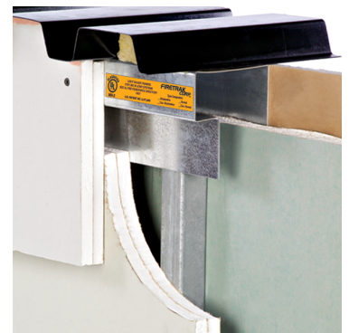
Fire Trak 2 Hr. Cavity Shadowline Shaft Wall - 2" Deflection