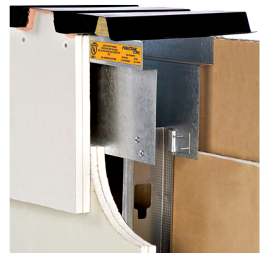
Fire Trak 2 Hr. Shadowline Standard Wall - 6" Deflection