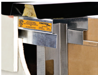
STANDARD WALL 1" MOVEMENT