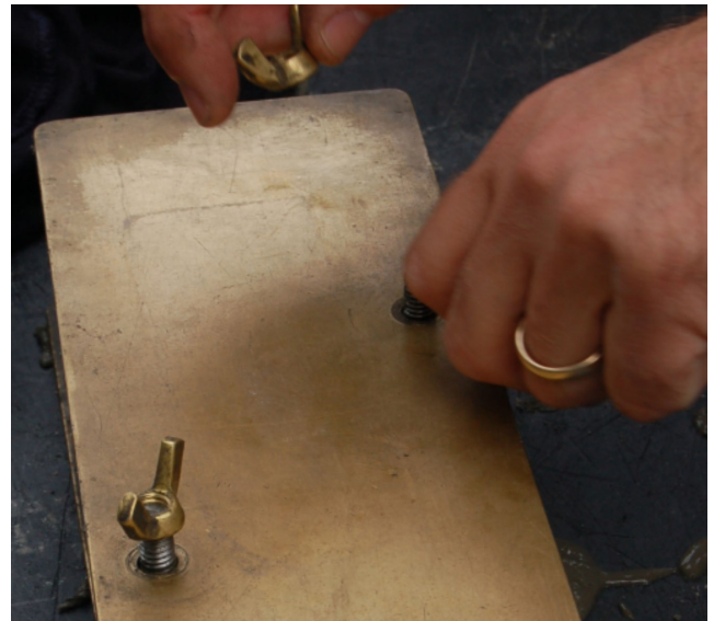
D.6. Place cover plate on mold and tighten with screws or clamps.