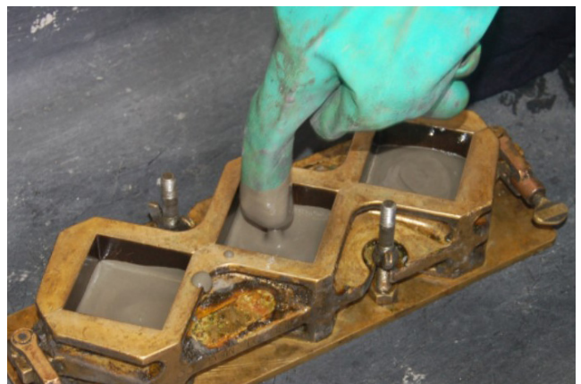
D.2. Puddle 5 times with gloved finger or tamping rod.

For information 1-800-243-2206 • FiveStarProducts.com