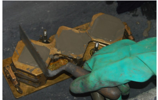
D.5. Clean off any excess material on top of mold.