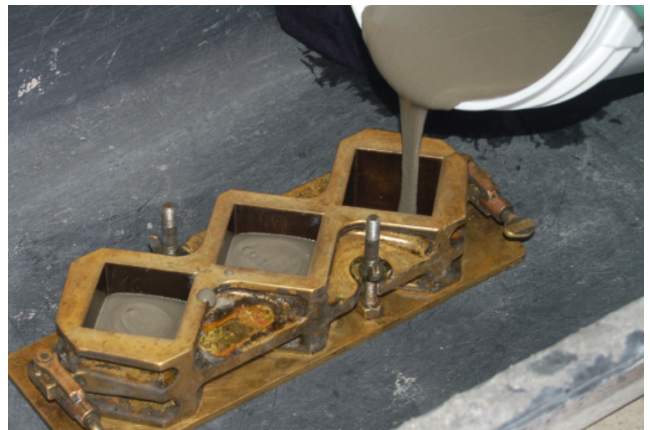
D.2. Fill cube mold ½ way with fluid/flowable grout.