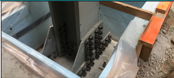
Preparation Includes Creating Forms Around the Beams