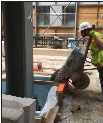
Pouring the DP Epoxy Grout