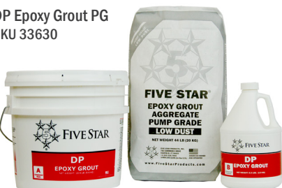
DP Epoxy Grout PG SKU 33630

ALSO AVAILABLE IN A SMALLER UNIT SIZE SKU 33175