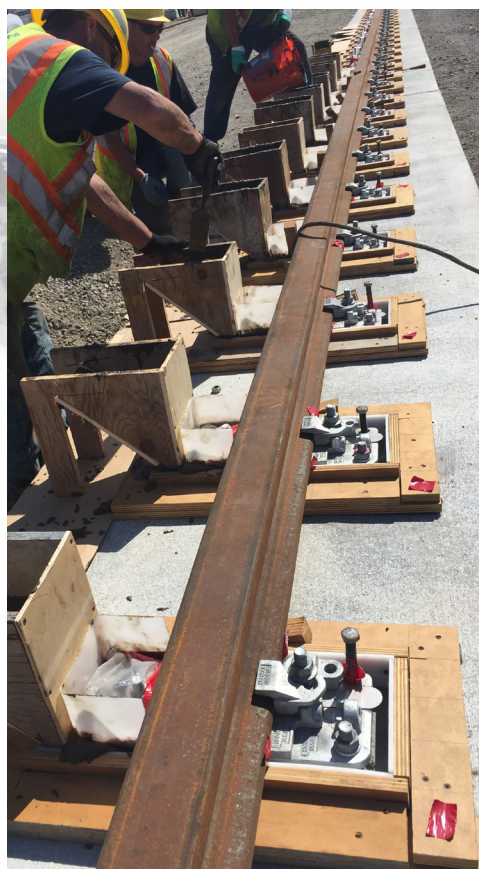
DP Epoxy Grout being used for crane rail grouting

Expansive and non-shrink for unparalleled support of equipment requiring precision alignment.