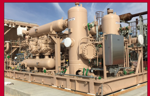
DP Epoxy Grout PG – Compressor Station Grouting