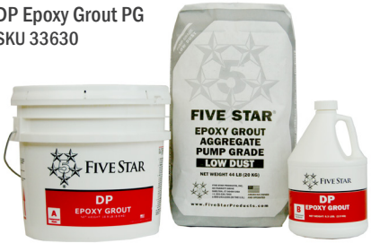
DP Epoxy Grout PG SKU 33630

ALSO AVAILABLE IN A SMALLER UNIT SIZE SKU 33175