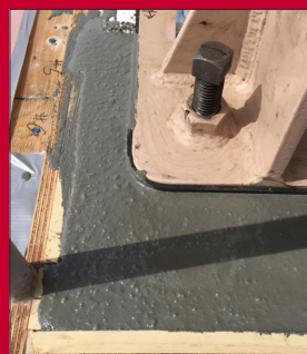
Pouring the DP Epoxy Grout PG