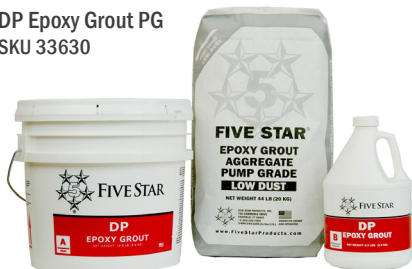
DP Epoxy Grout PG SKU 33630

ALSO AVAILABLE IN A SMALLER UNIT SIZE SKU 33175