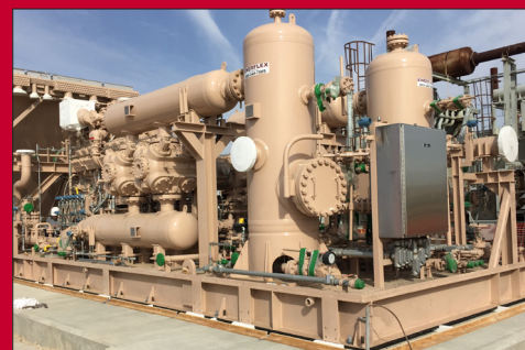
DP Epoxy Grout PG – Compressor Station Grouting