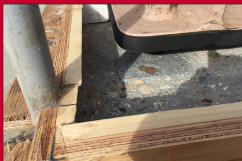
Setting Up the Forms