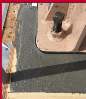
Pouring the DP Epoxy Grout PG