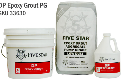
DP Epoxy Grout PG SKU 33630

ALSO AVAILABLE IN A SMALLER UNIT SIZE SKU 33175