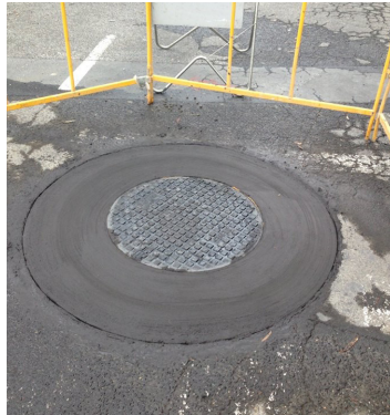
Completed manhole with Five Star® Highway Patch.