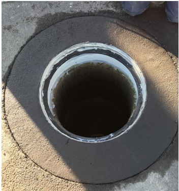
Five Star® Highway Patch placed to reinstate the substrate around manhole.