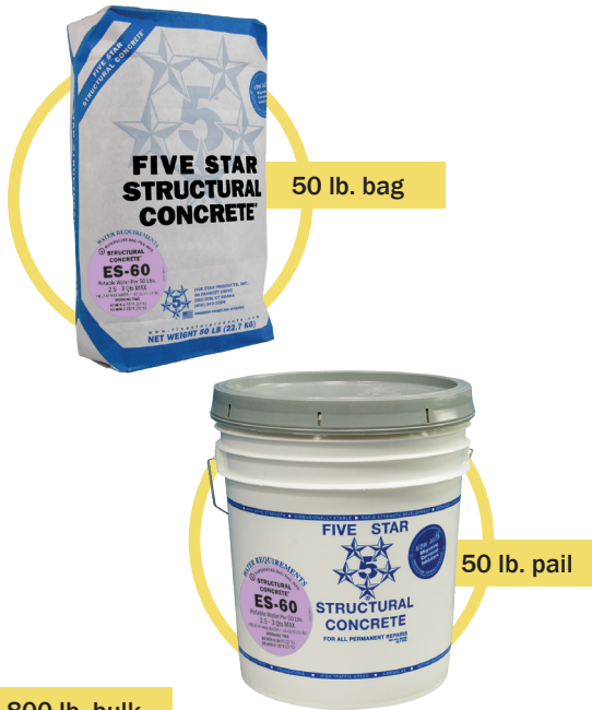
50 lb. bag