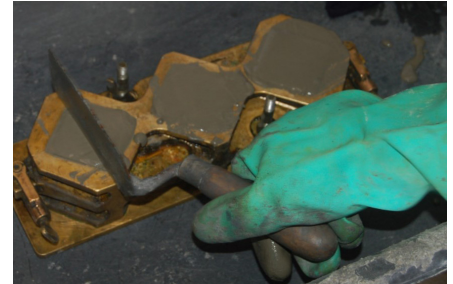
D.5. Clean off any excess material on top of mold.