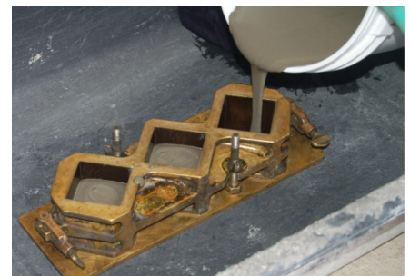
D.2. Fill cube mold ½ way with fluid / flowable grout.