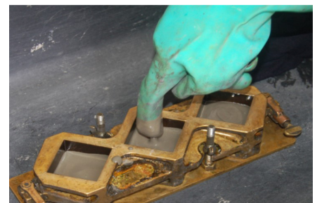
D.2. Puddle 5 times with gloved finger or tamping rod.

For information 1-800-243-2206 • FiveStarProducts.com