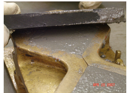
D.4. Screed off excess grout.