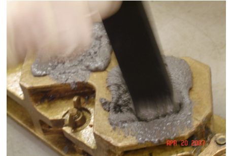
D.2. Fill molds halfway with epoxy grout, then tamp or rod to remove entrapped air.