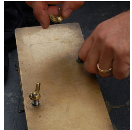
D.6. Place cover plate on mold and tighten with screws or clamps.

For information 1-800-243-2206 • FiveStarProducts.com