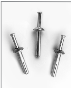
Drill-Tec™ Masonry Anchor