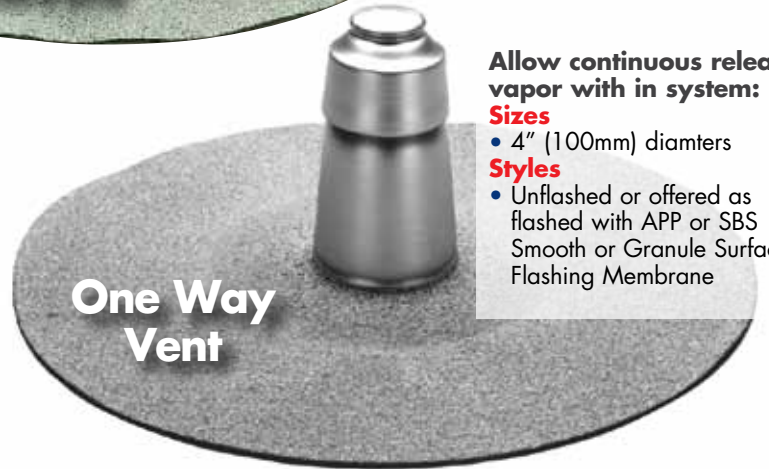
One Way Vent

"M-Weld® Accessories Are Perfect For New Installations, Re-Roof, Or Repair!"