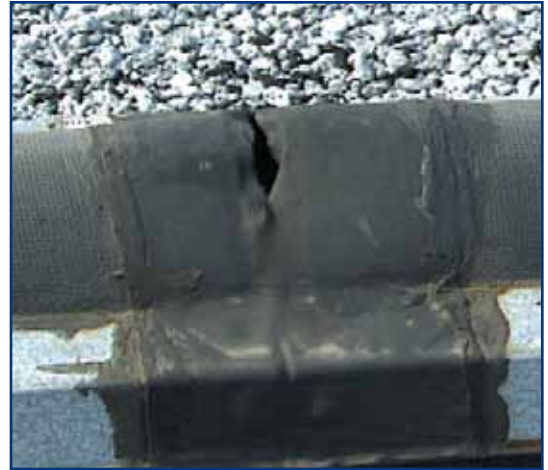
Splice Failure on Competitor's product

The Solution: Metalastic® Expansion Joint Covers in continuous lengths up to 250' eliminate up to 90% of splices—and leaks