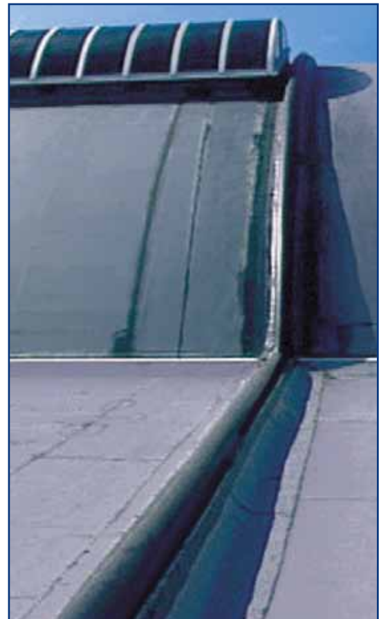
Metalastic® cover in continuous length run