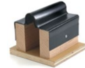
Curb-to-Curb (CMF) Style

GAF has designed the most flexible group of expansion joint covers in the industry. Metalastic® Expansion Joint Covers eliminate splice joints every 10' (3.05 m) and promote trouble-free roofing system performance. Available in four standard types.