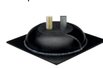
M-Curb™ System (Available in white, black)