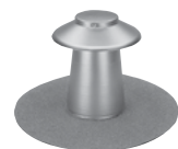
M-Weld™ Standard M-Vent™

GAF offers factory-built flashing accessories to complement asphaltic roofing systems. They are available for use with SBS or APP smooth or granule surface, and provide a professional, clean finish to roofing jobs.