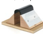
Cant-to-Cant (SMF) Style