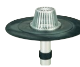
M-Weld™ Drain Insert