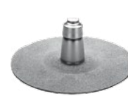
M-Weld™ One-Way Vent