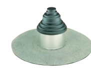
M-Weld™ Adjustable M-Vent™