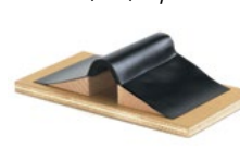
Low Cant-to-Cant (LP) Style