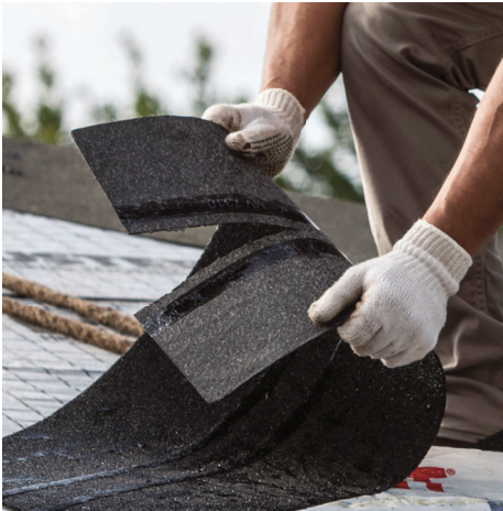
Tears in half easily along perforation for easy installation