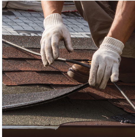
Installs at the eaves and rakes to help prevent shingle blow-off