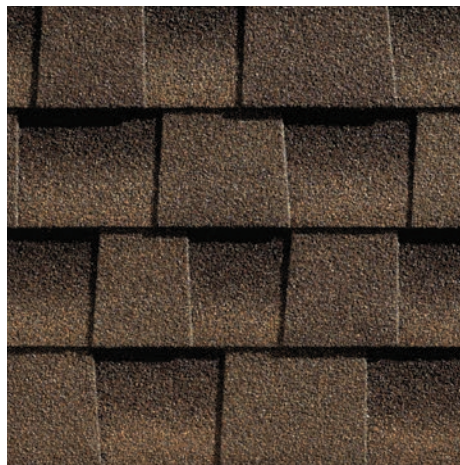
Beautiful finished look It's the same Timberline® Shingle you know and love, now even better