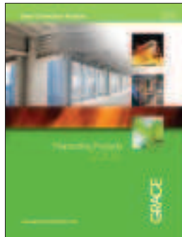
Fireproofing Products Section Number 07 81 00