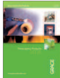
Firestop Products & Systems Section Number 07 84 00