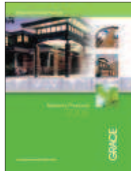
Masonry Products Section Number 04 22 00