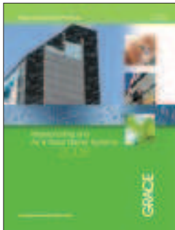
Waterproofing Products Section Number 07 10 00

G race offers a complete line of building products to help protect your most important structures. Remember to cross reference our other catalogs.