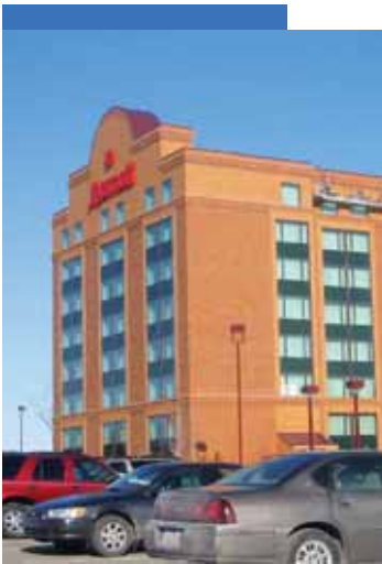
Marriott North Union Center Cincinnati, OH