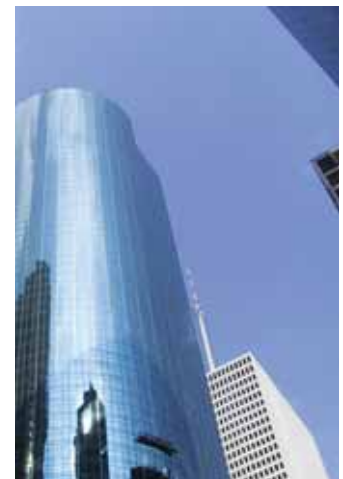
Wells Fargo Plaza Houston, TX