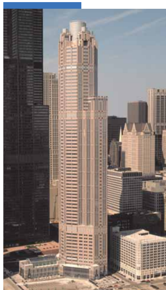
311 S. Wacker Chicago, IL

EWC24 – Premium formulation elastomeric with internally plasticized resins providing +300% elongation. Available in White, deep, and neutral bases, smooth and sand texture finishes.