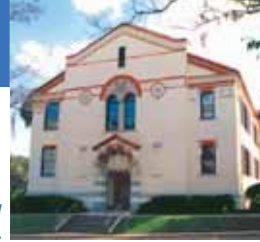
The Bloxham Building Tallahassee, FL