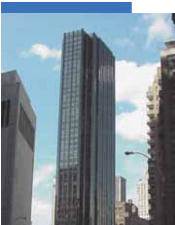
Trump International Hotel New York, NY