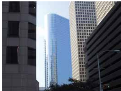
4 Allen Center Houston, TX