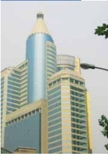
Golden Bell Plaza Shanghai, China