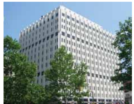
The Air Rights Center Bethesda, MD