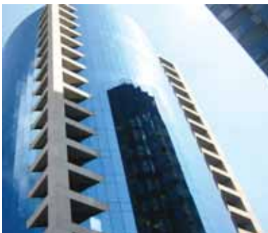
Droll Tower Mexico City, Mexico