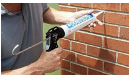
Filling voids with SilGlaze II Translucent sealant

Surfaces that will receive coating must be clean, dry, structurally sound and free of loose particles, dirt, dust, rust, oil, frost, mildew, and other contaminants. For most applications, cleaning with a high-pressure water wash should be satisfactory. Allow sufficient time after cleaning for the substrate to dry completely to the touch prior to the application of coating. Leak paths, such as cracks and holes, that are greater than 1/32" inch (1 mm) width must be repaired prior to coating application. Repairs should match the existing substrate as closely as possible in texture and color, as the Optic coating has minimal hiding power.