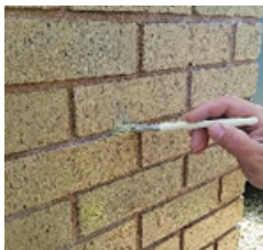
Brushing in raked mortar joints