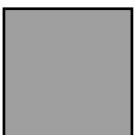
SCS9000.09 Aluminum Grey