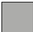
SCS9000.08 Light Grey