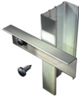
Pan Head Fine Thread Streaker®