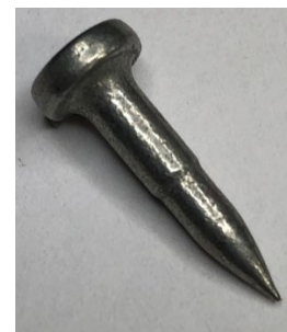
Part No. GTTP012 / GTTFP034