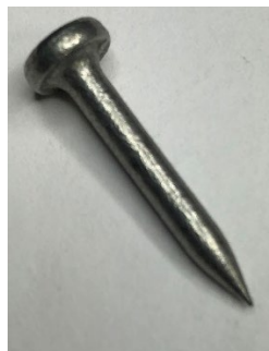
Part No. GTTP###