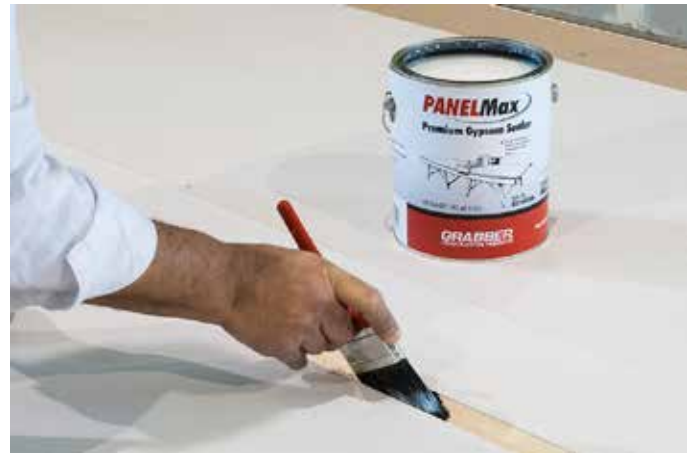
Prime and seal exposed gypsum using PanelMax primer