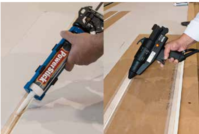
Apply PanelMax hot glue or PowerStick adhesive