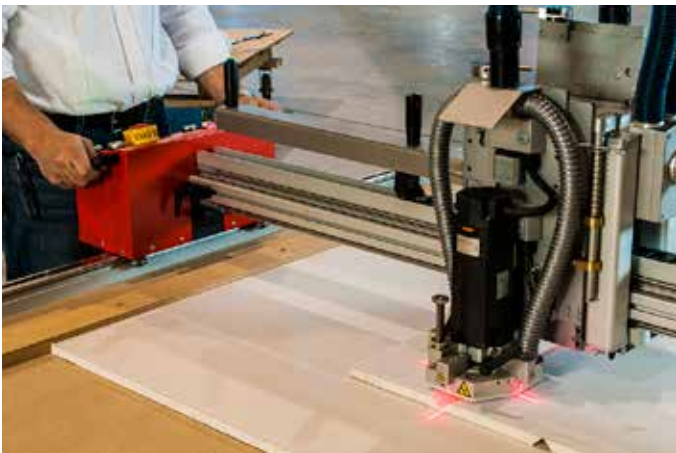
Rout assembly with the PanelMax panel fabrication machine

Don't take chances with untested and inferior materials