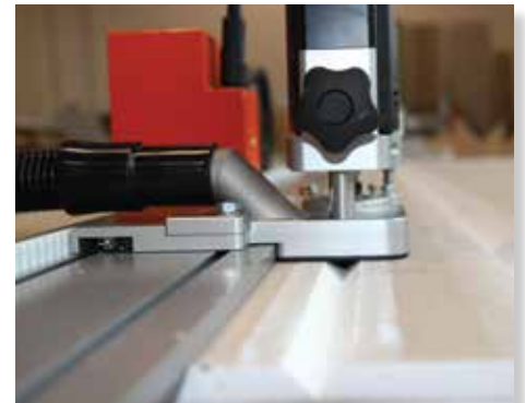
Comes standard with 1000watt milling unit and one 90degree bit