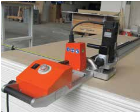
Advanced variable speed control to maximize efficiency and job schedule