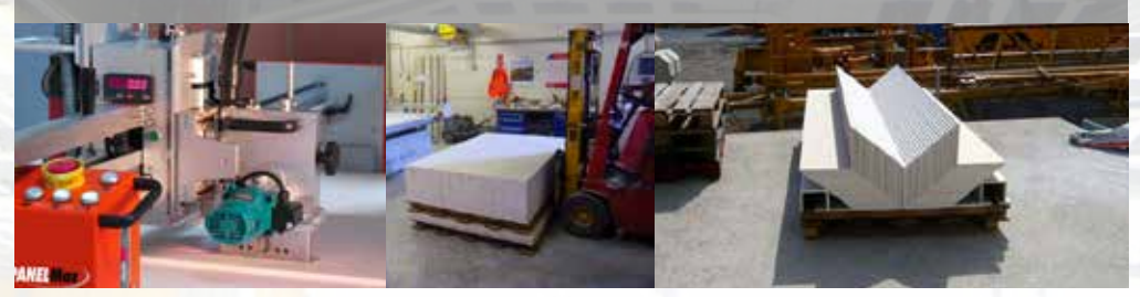
Precision milled, by a certified fabricator. . .