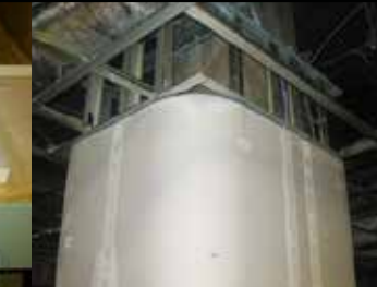
Molding detail w/returns