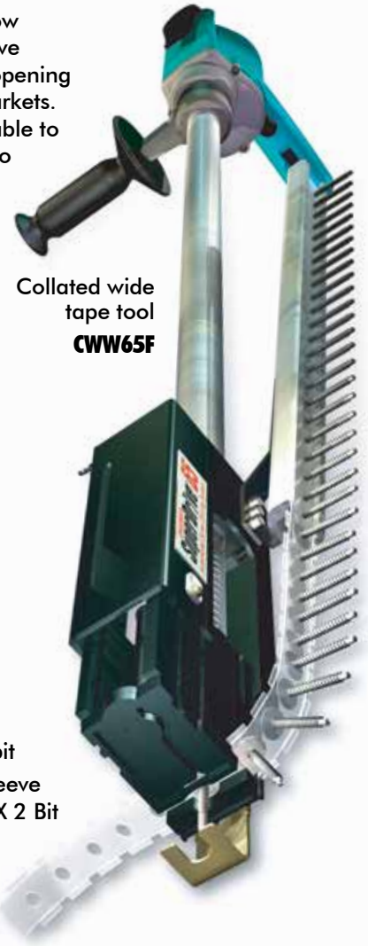
Collated wide tape tool CWW65F

A new dimension is now added to the SuperDrive Fastening potentials, opening new industries and markets. The SuperDrive 65 is able to drive screw heads up to 15mm in diameter.