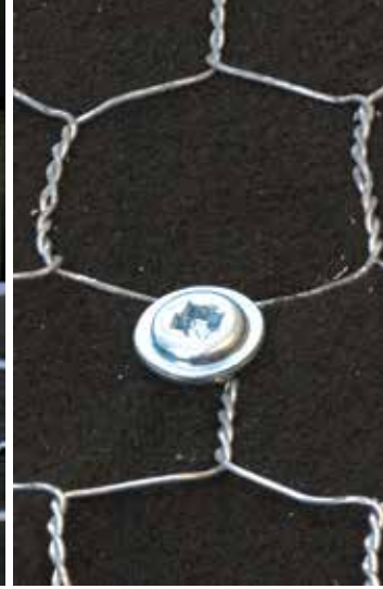
LOX Lath Fastener