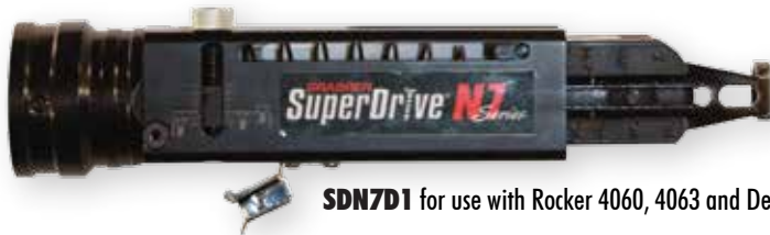
SDN7D1 for use with Rocker 4060, 4063 and DeWalt DW272, DW266, DW274K