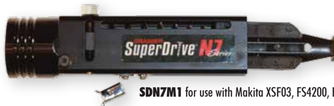
SDN7M1 for use with Makita XSF03, FS4200, FS4300