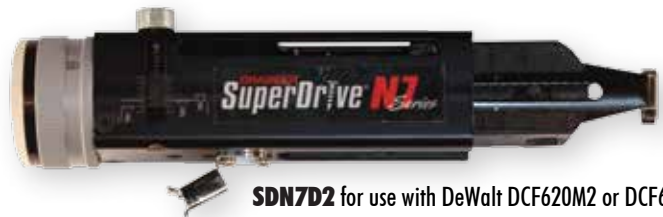
SDN7D2 for use with DeWalt DCF620M2 or DCF620D2